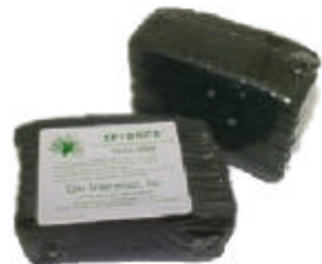
A-18328 EpiBrite, 100 pads/case

MONTHLY: Wipe ring faces with EpiBrite (available from Epic), and externally clean the holder, rail and separators. Regular monthly use of EpiBrite removes traveler debris from surface pores; passageways. KWH savings are about 5-6%. Cleaning the holder, rail, and separators prevents black staining of yarn.